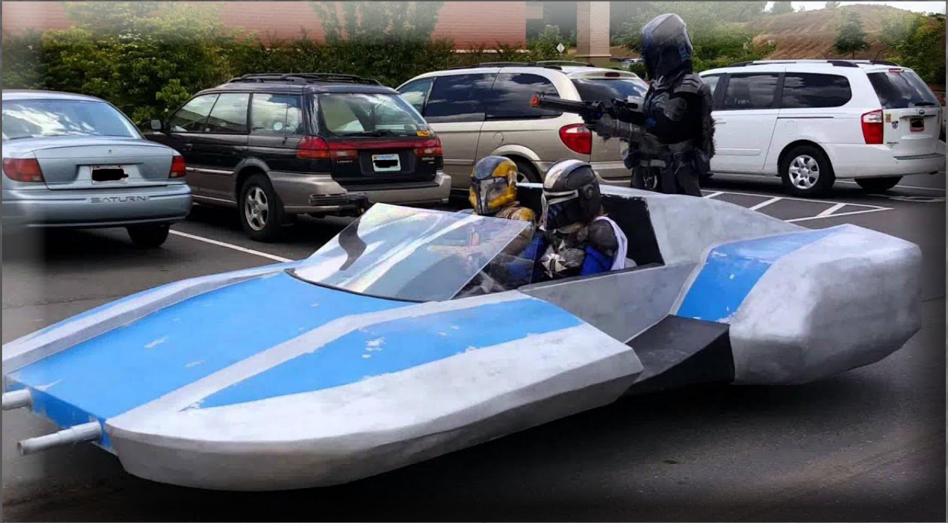
In 2015, Mercs members built the MandalMotors "Shriek-Hawk (Jai'galaar) Class" light Cavalry/recon landspeeder - based on an unnamed speeder seen in The Clone Wars episode "The Lawless," first shown to the world at Star Wars Celebration Orlando.