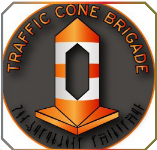
“Do you get called “day-glo” on a regular basis? Does your clan use you to direct traffic at events? Does your kit blend in better on Mustafar than other planets? Then this might be the society for you!” - “Traffic Cone Brigade” informal society.

You can find the formal and informal social societies on the main page of the forums under “societies of Mandalor”.