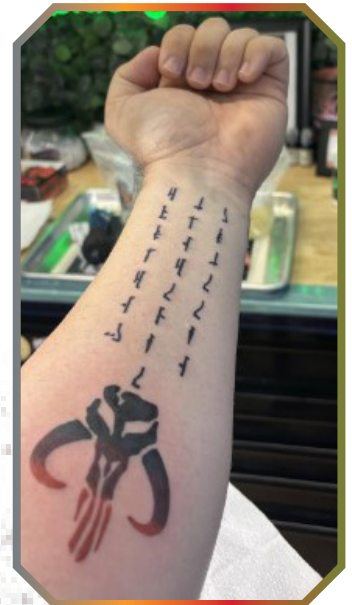
Members of the V.O.T.S - Mandalorian Tattoo Club - show off their new ink on the forums.

In the MMCC, societies are more than just social groups—they are outlets for personal expression, community support, and cultural enrichment.